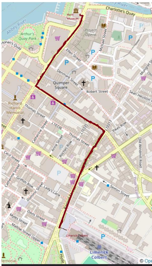
Map from OpenStreetMap.org.

We are a 15-minute walk from Limerick's Colbert train and bus station (Eircode: V94 H2PP). Use this link for more information: Colbert train and bus station .