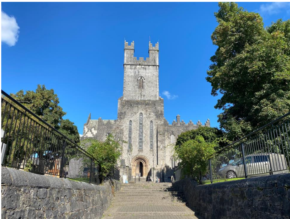
Image Above: Saint Mary's Cathedral which is located opposite the Potato Market