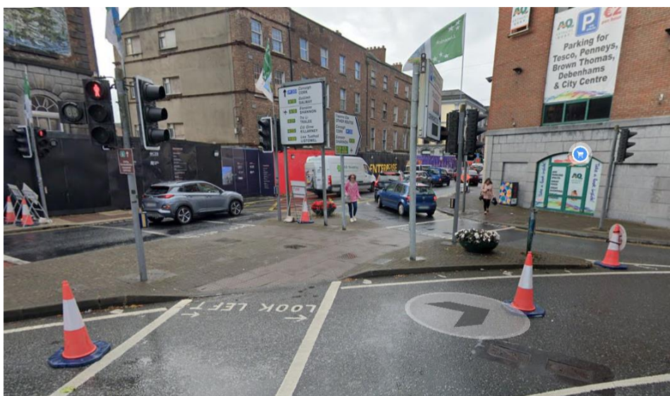
A screenshot of the island from Google Maps.